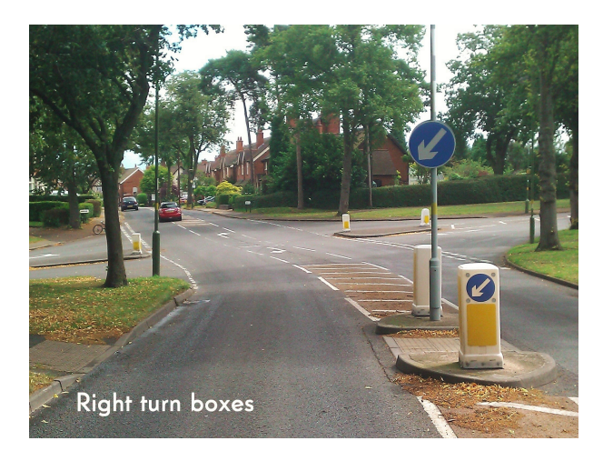
RESERVED SPACES for turning right